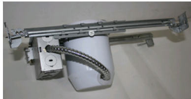
5" ~ 6"