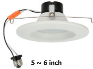
5 ~ 6 inch