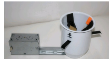
5" ~ 6"