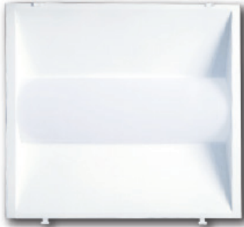
36W 2' x 2'