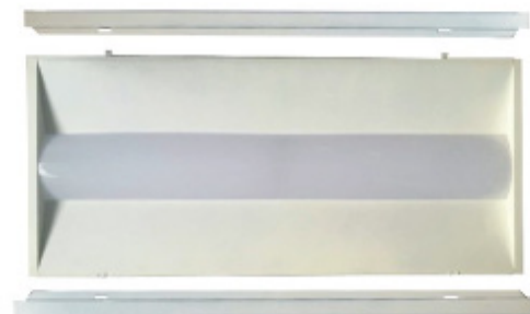
36W 2' x 2'