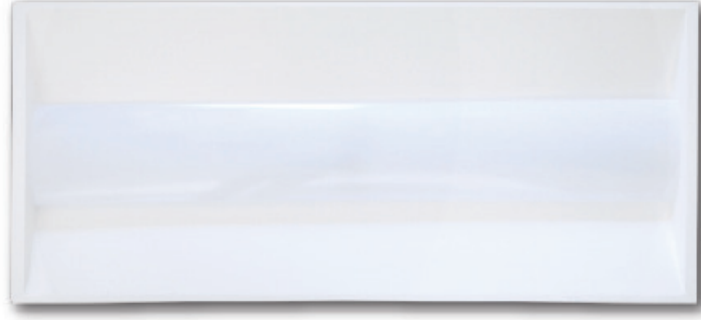
50W 2' x 4'